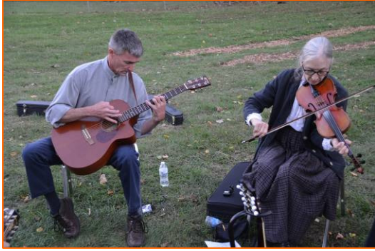
Members of the Nashville Old Time String Band.