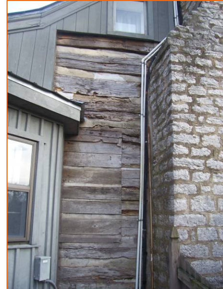
West wall deterioration.