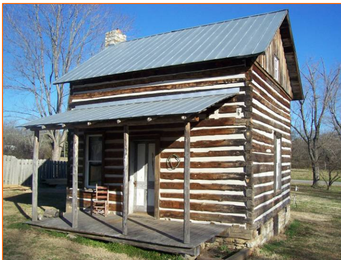
Chinking and log cleaning and preservation have been completed. 1-30-2012

Activities at the Addison Museum: As with the Buchanan Log House, Middle Tennessee State University prepared a detailed study of the architectural significance of the BLH and the Addison House. As part of this effort, they made several recommendations to preserve, repair and enhance the educational aspects of