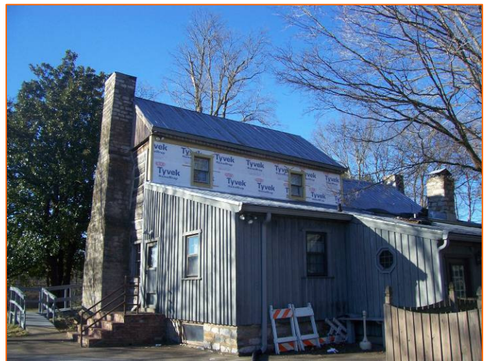
Buchanan Log House west wall and second story repairs. It is believed that the roof leaks are a result of deteriorated logs on the second floor and these repairs should fix those problems. 1-30-2012

Cumberland University: Tennessee Maneuvers Veterans to Receive Honorary Masters Degrees from Cumberland University 'Remembrance and Respect' is set for May 8, 2012. The terrain of middle Tennessee allowed soldiers to make river crossings and engage in simulated combat in conditions similar to those expected in France and Belgium. From 1941 to 1944, more