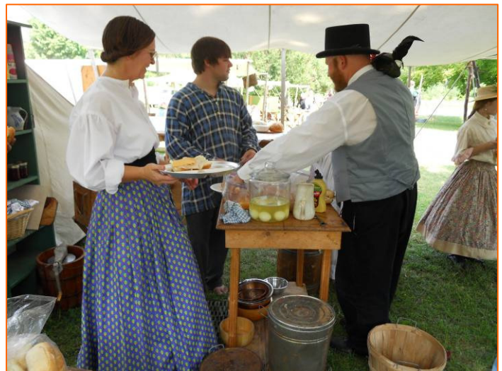
Food was fantastic at this year's Fall Festival, and the 19 th Alabama Civilian Corps had their own lunch prepared...pickled eggs!! October 1