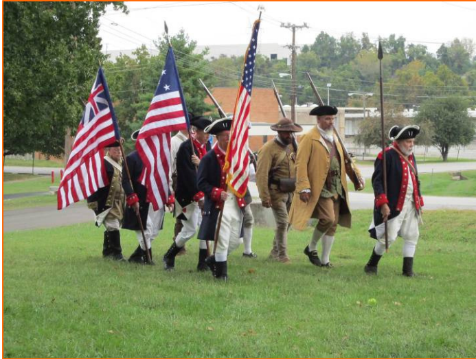
DeLeusomme Guard presents the colors beginning with the Stars and Strips, 13 Star US Flag, and lastly the Flag George Washington carried during the Revolutionary War with Great Britain. 9-30-2012