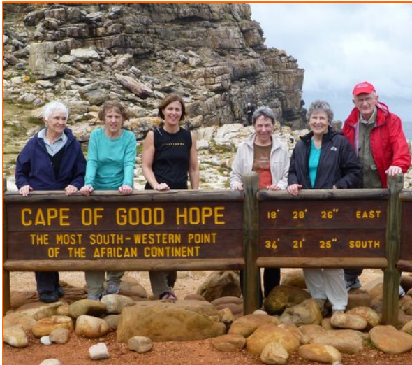
The Prathers and Lu recruit BLH members at the southern tip of the African Continent.