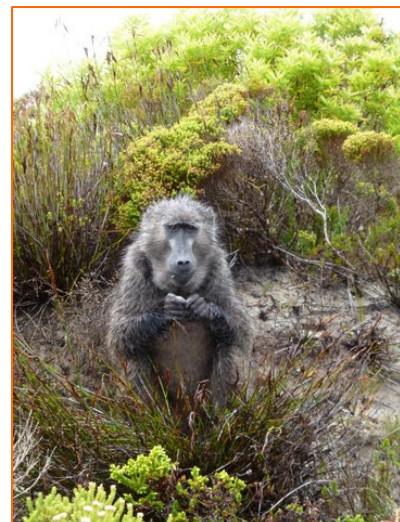
Tell me more about the BLH. Photo by BLH's Sally Prather of South African Baboon.