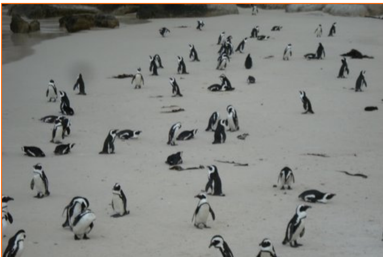
The BLH can accommodate large groups. Photo by BLH's Sally Prather of South African Penguins.