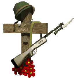
Memorial Day May 27th