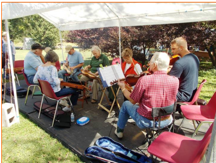
Excellent folk music could be heard throughout the day. 9-21-2013