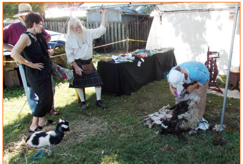
There is nothing that catches the attention of kids and adults alike than a demonstration that relates to animals/livestock. 9-21-2013