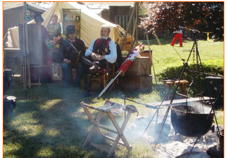
19 th Alabama Civilian Corps encampment. 9-21-2013